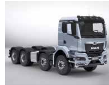
CAB NN: THE PRACTICAL ONE (narrow, medium length, standard height)