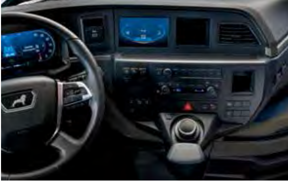
Infotainment system with 7-inch display and MAN SmartSelect