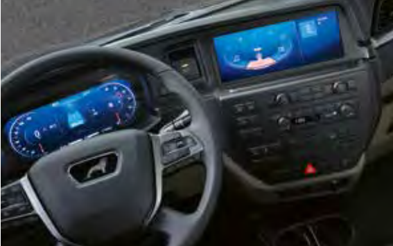
Infotainment system with 12-inch display and control system below the secondary display