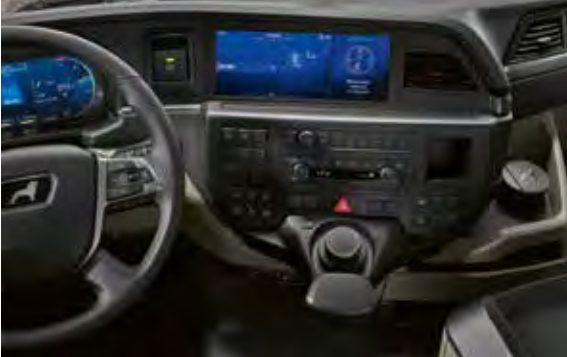
Infotainment system with 12-inch display and MAN SmartSelect

The infotainment system can be operated either via a classic control system with buttons or via MAN SmartSelect (can be combined from version Advanced 7 inch). Throughout, familiar usage meets innovative comfort. The result is one you can see and feel, too, as high-quality surfaces make every journey with the new MAN TGS tangibly special.