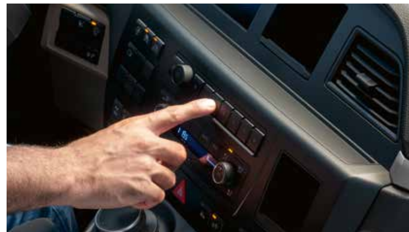
Freely programmable direct access buttons fitted with touch sensors

Theory times experience: the controls for the new MAN TGS are the result of combining the latest scientific analyses with insights from intensive on-road tests with drivers.