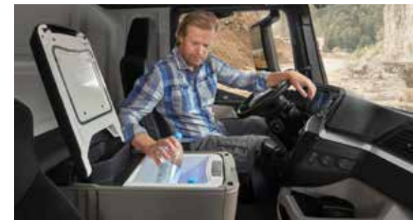
Perfect for independent types: on-board coolbox/fridge

To create the perfect feel-good environment, the entire interior can be tailored to suit you down to the ground. From the colour scheme (Desert Beige or Moon Grey) to the storage space in the cab and even the interior lighting, everything can be customised to your needs – while maintaining a clear focus on the functionality which will never let you down.