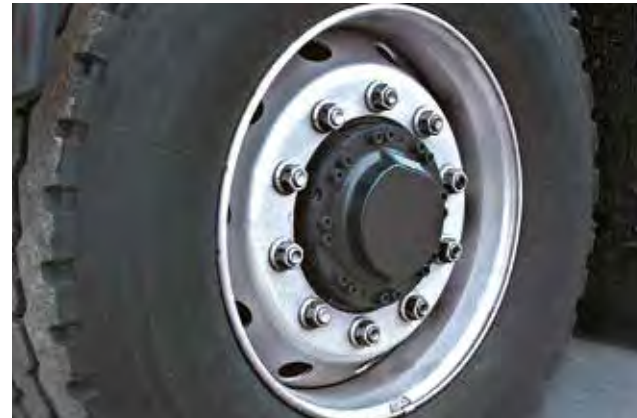
Front axle with hydrostatic wheel hub motors

Of course, anyone who makes it up the mountain wants to come back down again, too. That's where the MAN BrakeMatic smart brake with electric braking and ABS comes into play. They make it possible, for example, to maintain a constant speed when going downhill by regulating the sustained-action brakes automatically. In situations where you have to react fast, the MAN braking system is exactly the partner you want at your side, too: based on the strength of pedal movement, the braking assistant recognises when hazard braking is needed and immediately activates full braking power. No matter where the road takes you, the new MAN TGS gives you the power and security you need.