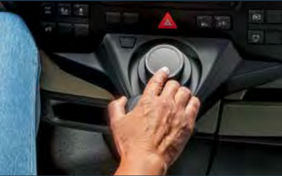
Innovative MAN SmartSelect multimedia control

The driver's cab is the heart of the new generation of MAN trucks. We've reimagined the cab from floor to ceiling – because comfort in the cab means easier workflows and faster completion of your haulage jobs. Ideal conditions for higher driver motivation, and that translates to an investment that pays you daily returns. The completely new controls of the MAN TipMatic® automatic gear shift system situated directly on the steering column stalk is just one example.