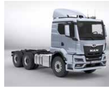
CAB TN: THE FLEXIBLE ONE (narrow, long, standard height)