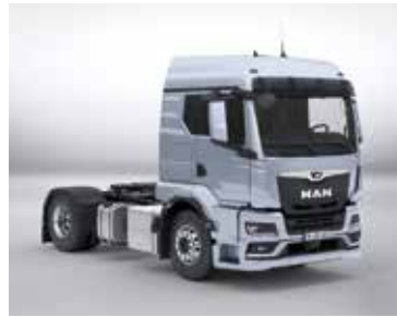
CAB TM: THE COMFY ONE (narrow, long, medium height)